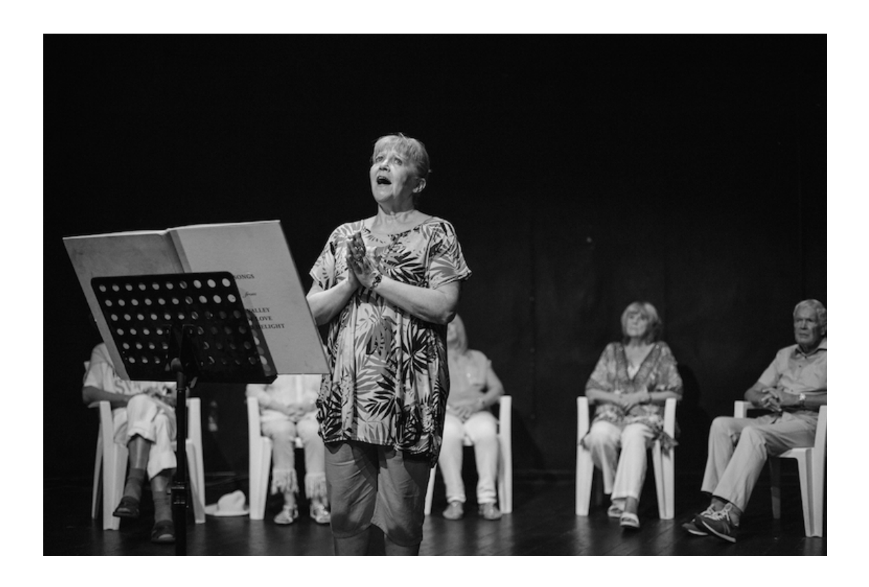
Syden. Songs from a Valley of Love and Delight