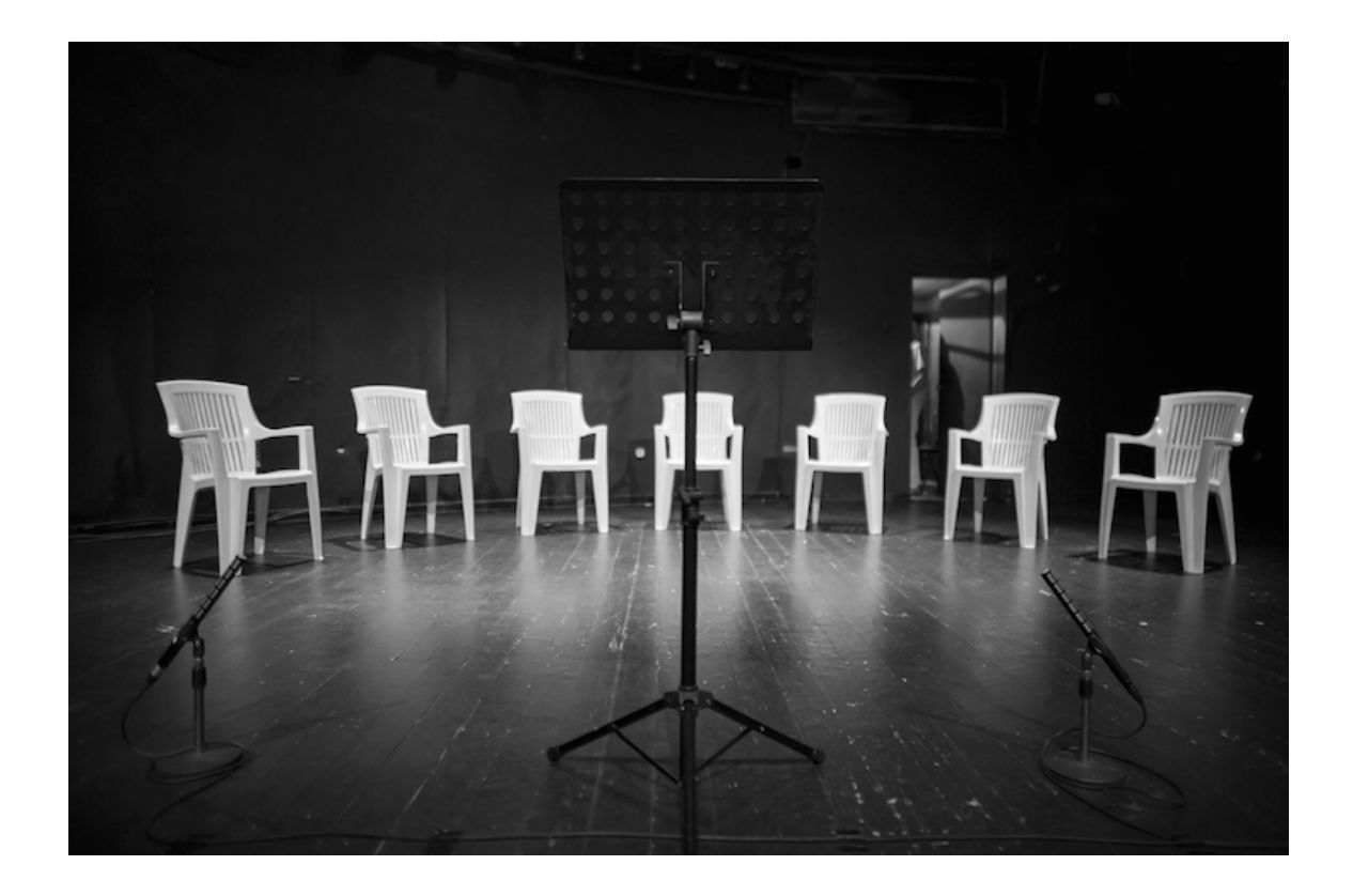
Syden. Songs from a Valley of Love and Delight