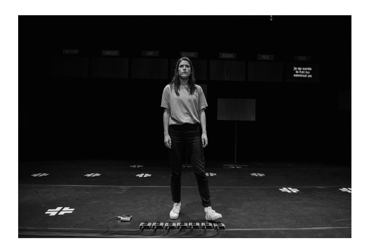
Mining Stories

The format of the essay is hence a genre par excellence that could make people aware of their shared responsibilities and the power they have in order to react. This focus on agency expresses the aim and desire of the essay to construct "a speaking "I" who is inquisitive, pensive, searching and self-searching, engaged and self-reflexive. It is an "I" who wishes to address and engage within a shared space of embodied subjectivity" (Rascaroli 2009: 191).