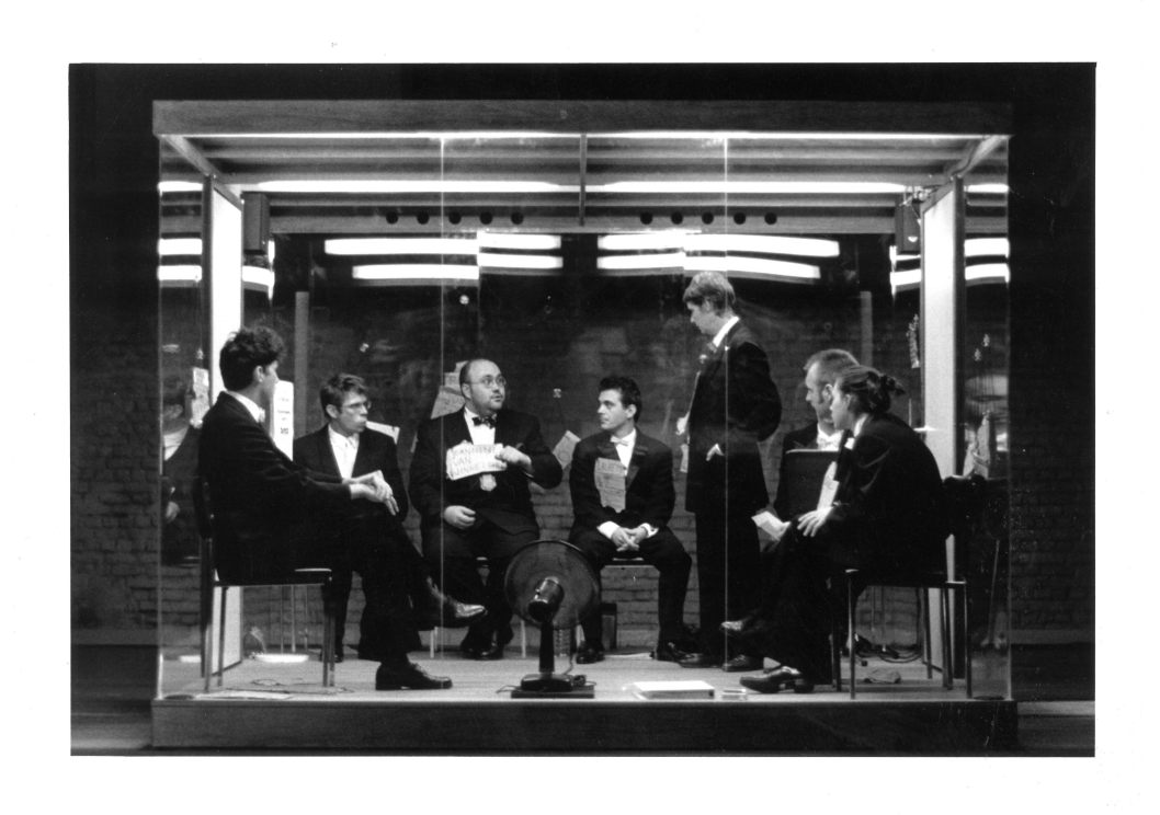
Figure 3.2. Dito'Dito & Transquinquennal, Ah oui ça alors là / Ja ja maar nee nee (1997).