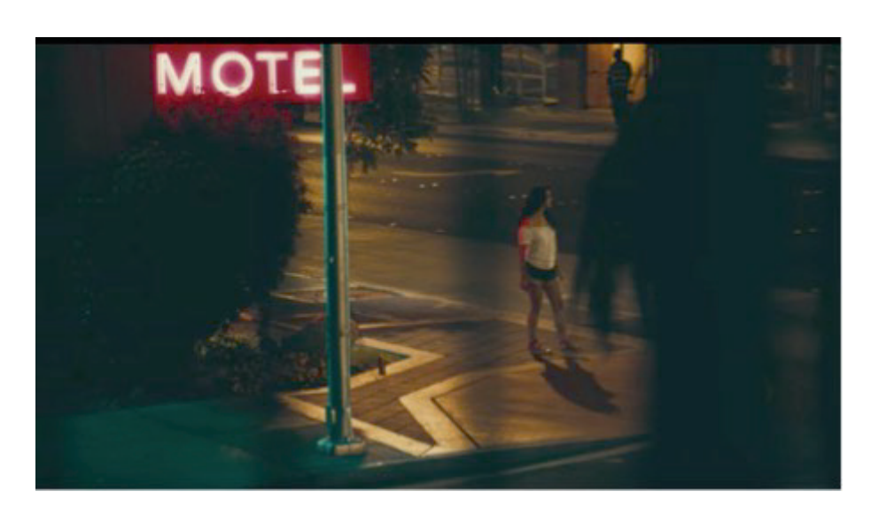
Fig. 12. The motel in Lana Del Rey, Ride (1:05)