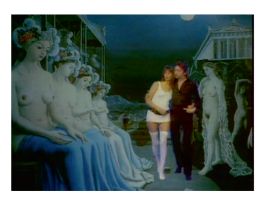
Fig. 3. Serge Gainsbourg with Melody Nelson in Serge Gainsbourg, Histoire de Melody Nelson (13 : 46) and (10:19)