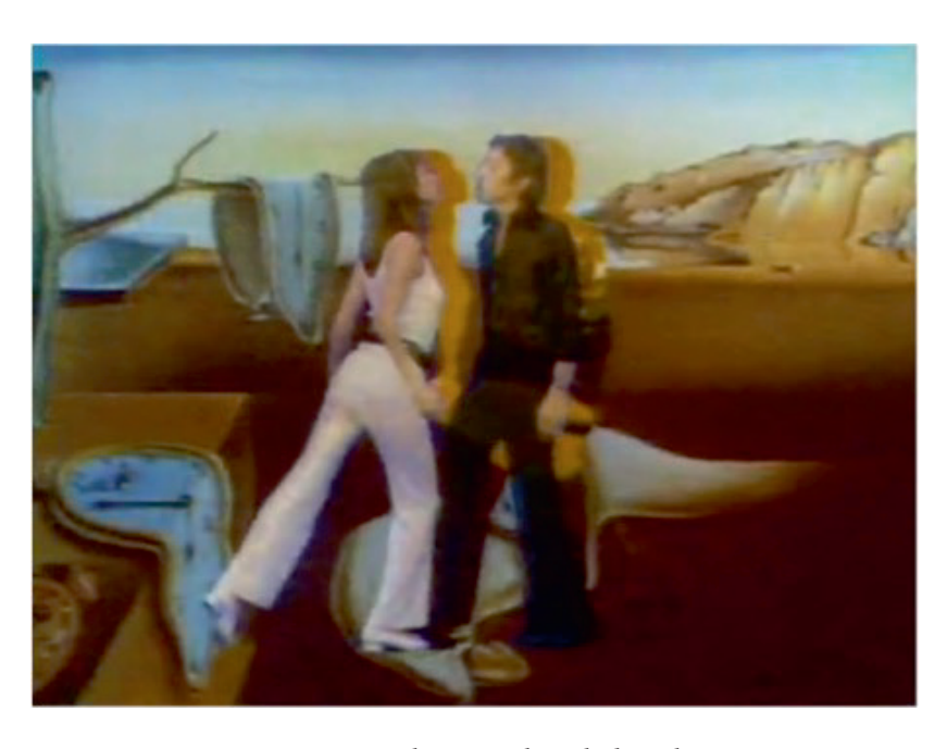
Fig. 4. Serge Gainsbourg with Melody Nelson in Serge Gainsbourg, Histoire de Melody Nelson (13:46) and (10:19)