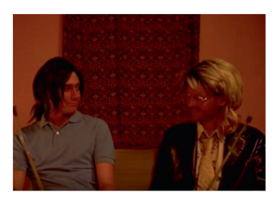
Fig. 1. Boston and Dobsyn in Connan Mockasin, Con Conn was Impatient (0:15) and (2:54)