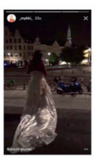
Fig. 10. @MykkiBlanco. "Running around in wedding gown" Instagram stories , 6 May 2017