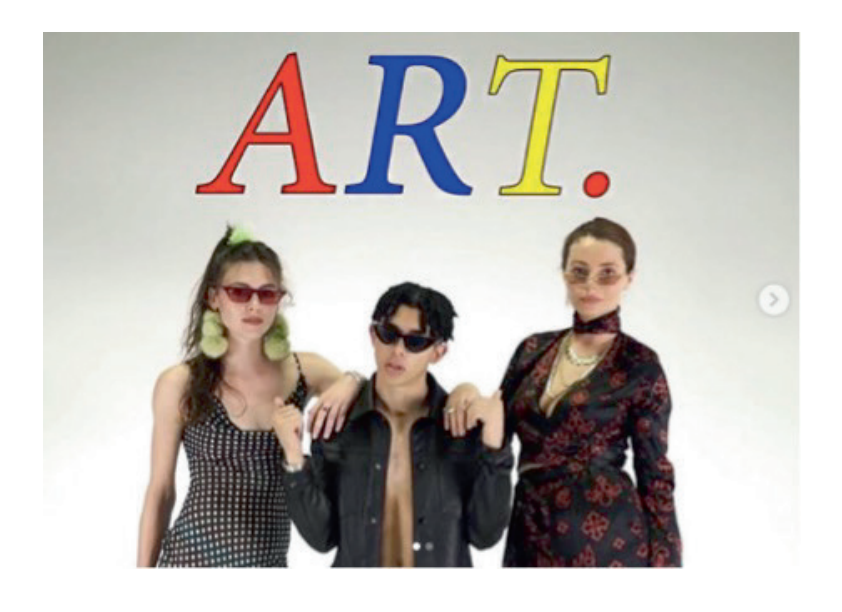
Fig. 6. @jimothylacoste. People get frustrated when they see us using clothes as art. Link in bio #ExpressUrself." **Instagram*, 28 September 2018.** www.instagram.com/p/BoRvfWilEJA/