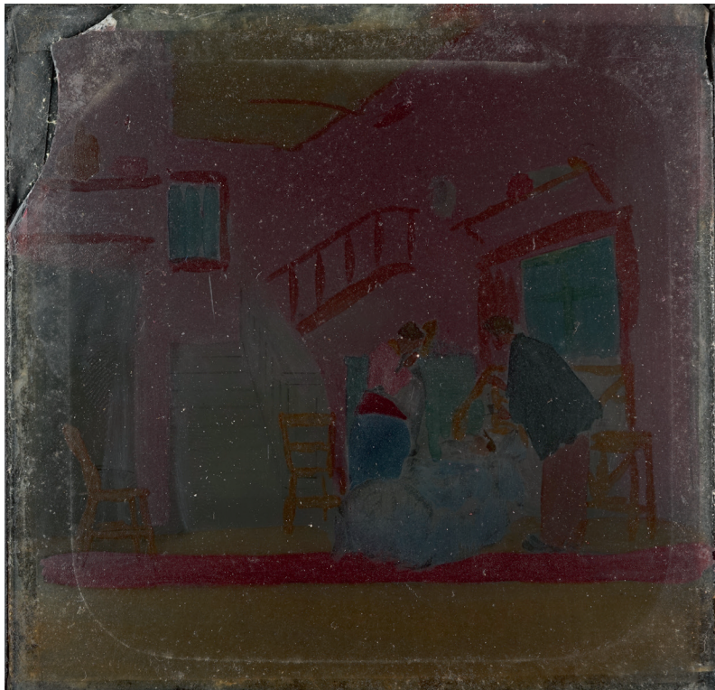
Fig. 11. Slide 5 of Little Jim without backlight (York & Son, 6 slides, s.d.).