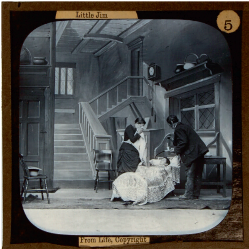
Fig. 1. Slide 5 of Little Jim . (York and Son, 6 slides, 1885) Collection 2018 Nicholas Hiley, Lucerna Magic Lantern Web Resource, lucerna.exeter.ac.uk , item 5022074. Accessed 6 November 2019