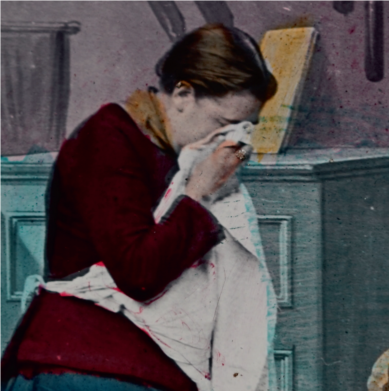
Fig. 10. Detail of slide 5 of Little Jim (York & Son, 6 slides, s.d.).