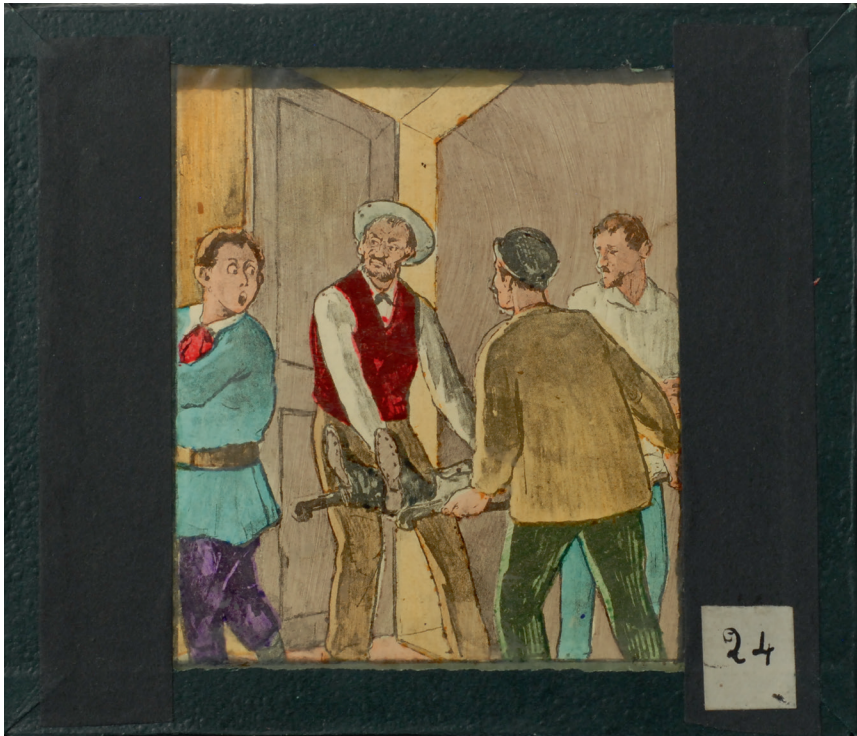
Fig. 4. Slide 24 of Un poison mortel (TOLRA, 29 slides, s.d.).