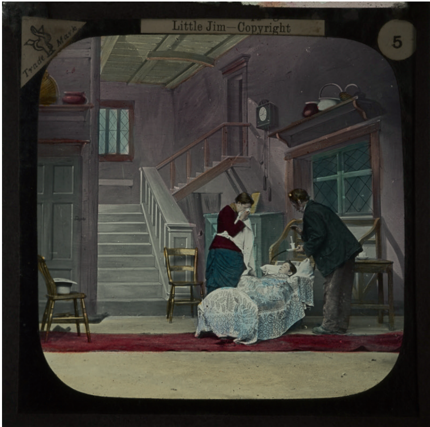
Fig. 2. Slide 5 of 'Little Jim' (York & Son, 6 slides, s.d.).