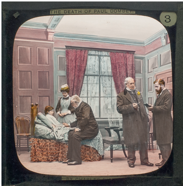
Fig. 6. Slide 3 of The Death of Paul Dombey (York and Son, 6 slides, s.d.).

opacity (Robinson 73). As for the colouring, the artists who tinted the images often did not follow any precise rules but instead coloured the pictures according to their own tastes (de Roo). Frequently, colours were used differently in comparable slide sets (Fig. 6 and 7), as MacDonald also observes: “It is common to find examples of the same set with completely different coloring [...]” (26). Moreover, even within one and the same set the colours could differ considerably. This is illustrated in the slide series ‘The Death of Paul Dombey’—an adaptation of a scene from Charles Dickens’ lengthy novel in six scenes—preserved in the collection of the Cinémathèque royale de Belgique (Fig. 6 and 8). Without additional sources, however, it is impossible to find out exactly why this is the case. Were several colourists working on the same series, or have the plates been replaced or put together later on with plates from a similar series? We can suggest several hypotheses but at this moment it is impossible to answer the question with certainty. The hand colouring of slides remained an important part of the production process until the 1920s. Later, colour photography and the trichrome printing processes, such as Kodachrome by the Kodak Company, signalled the end of professional, hand-painted colouring of photographs.