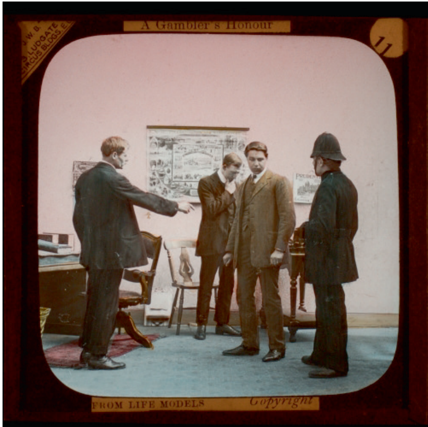
Fig. 14. Slide 11 of A Gambler's Honour (Bamforth & Co., 24 slides, 1910). Accessed 6 November 2019