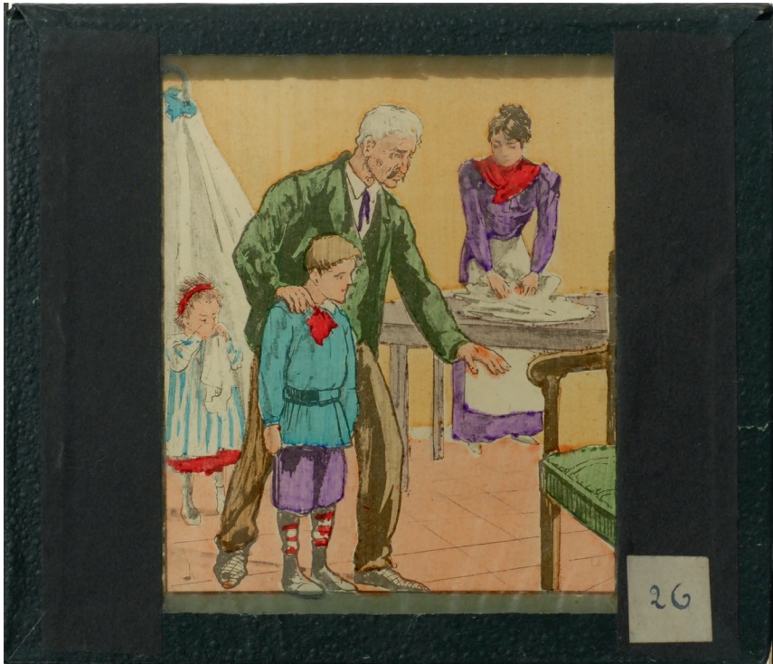
Fig. 5. Slide 26 of Un poison mortel (TOLRA, 29 slides, s.d.).