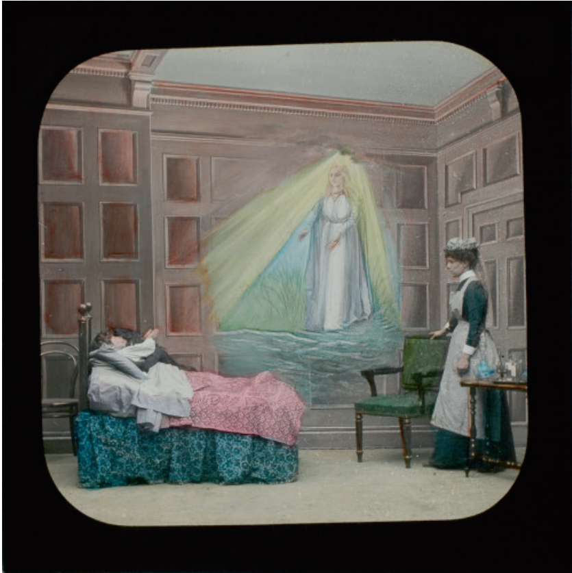
Fig. 8. Slide 6 of Death of Paul Dombey (York and Son, 6 slides, 1893).