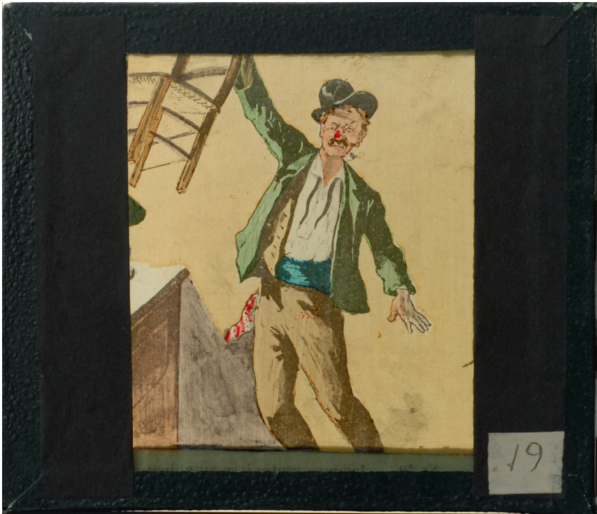
Fig. 3. Slide 19 of Un poison mortel (TOLRA, 29 slides, s.d.). Collection KADOC-KULeuven