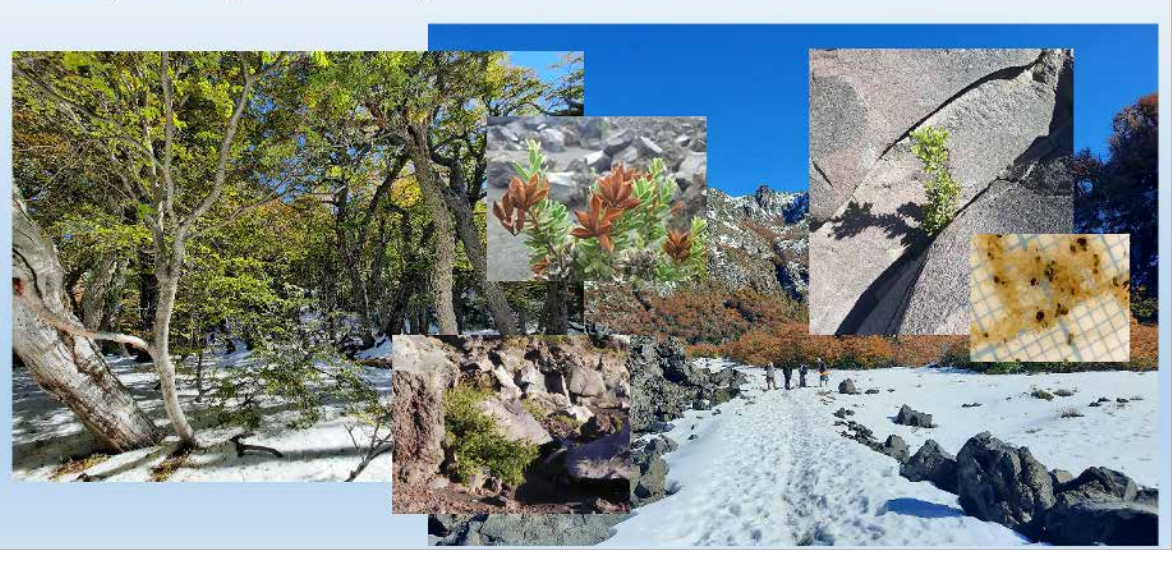
Figure 4. Slide from Professor Zuñiga workshop's presentation on roots.

What does it mean for a plant to grow in the mountains? (Termas de Chillán, Shangri-La Forest)