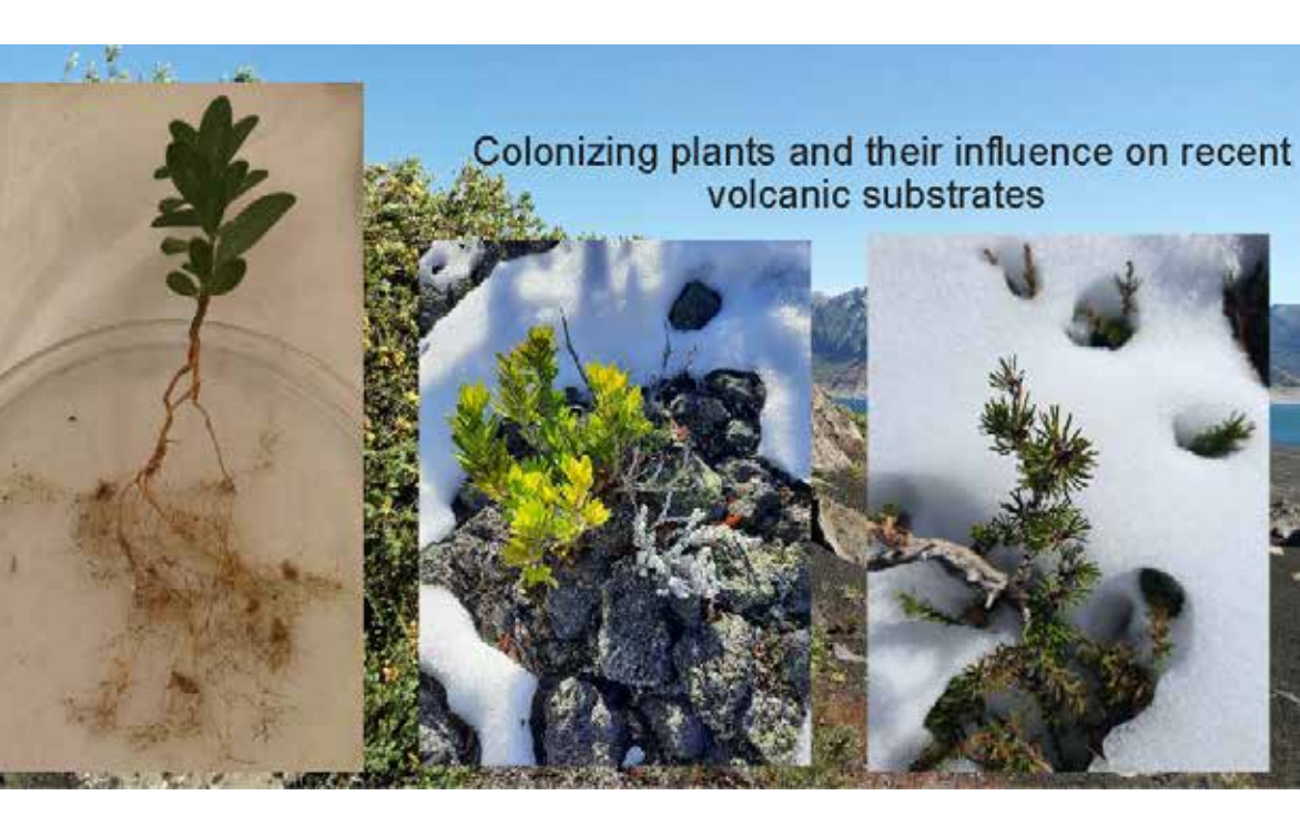
Figure 5. Slide from Professor Zuñiga workshop's presentation

several species coexist (Cavieres et al. 229). We have seen that in many cases these neighbours have nutritionally complementary adaptations in their roots and thus one of these species can provide a type of resource which can be shared by the inhabiting species of that patch. We have detected this among species that grow on volcanic substrata in Patagonia, where notro ( Embothrium coccineum ) and cadillo ( Acaena integerrima ) are better supplied with nitrogen and phosphorus when they grow together, on the material expelled by the Hudson volcano (Piper et al. 12). These complementary radical adaptations occur in plants that have mycorrhizae (associated with fungi), nodules with nitrogen-fixing bacteria (an element that comes from the air) or proteoid roots (RP), which allow them to solubilizesparkly phosphorus from the soil.