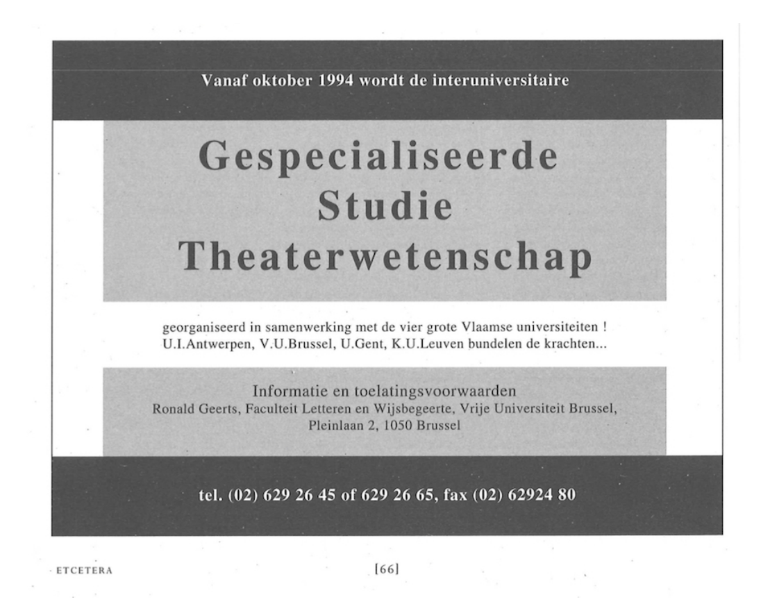
Figure 2.2. Advertisement for the new Specialized Study in Theater Studies (GGS) in a 1994 issue of theater magazine Etcetera .

Making a virtue of necessity, but also understanding that collaborating was the only way to ensure the future of theater studies in Flanders, a new generation slowly took over the wheel in the middle of the 1990s and put their heads together.<sup>41</sup> Out of these negotiations, the interuniversity Specialized Study in Theater Studies arose, a so-called GGS, which means that it was aimed at students already having some prior knowledge of the discipline.<sup>42</sup>