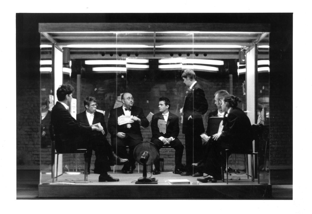
Figure 3.2. Dito'Dito & Transquinquennal, Ah oui ça alors là / Ja ja maar nee nee (1997).