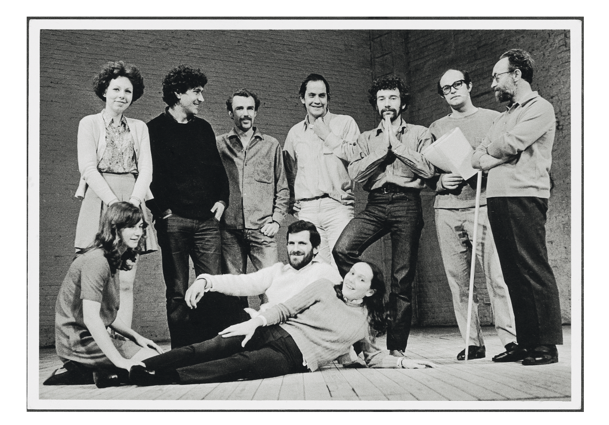
Figure 2.1. Group photo of the Werkgemeenschap in 1969.