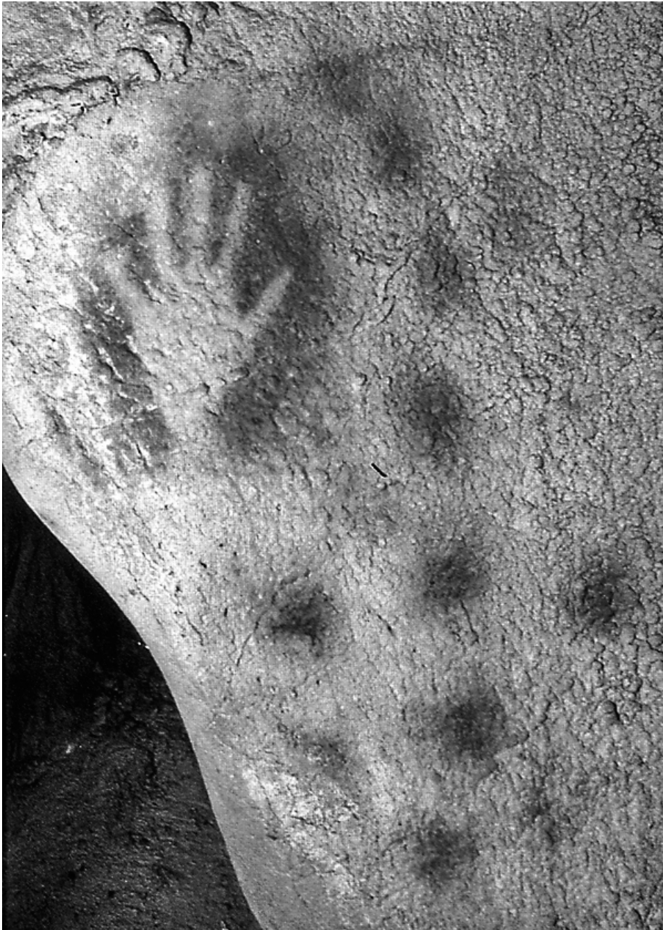
Prehistoric negative hand in the Pech Merle grotto (Lot, France)