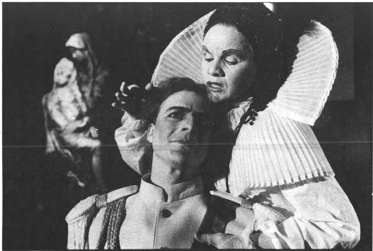
“Prinses Maleine” in het N.T.G.