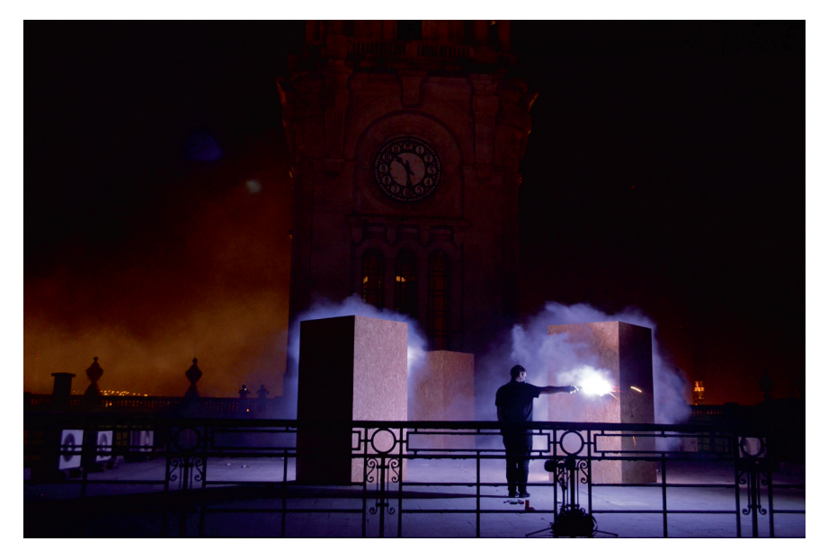
Live Arts Week IV Bologna 2015

Yes, absolutely. It is quite an appropriate definition of what we aim to do with this piece. As a matter of fact, we may only have the initial steps of the performance agreed beforehand, how we then proceed is in response to our feeling for the audience's degree of passivity and how the space may allow for different ways to engage with and disrupt that passivity.